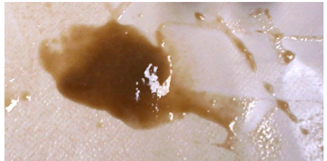
Effectively removes membrane biofilms

Under normal storage conditions the shelf life of Genesol 704 is 1-2 years. Ensure the packaging is sealed after use and the Genesol 704 remains dry.